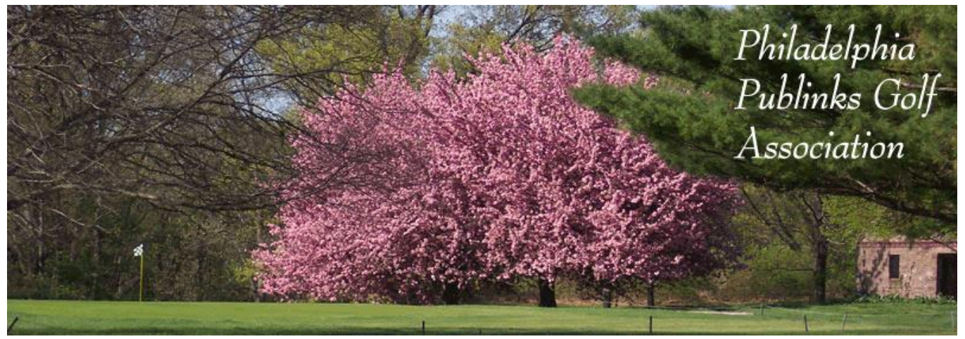
14th Hole at Cobbs Creek GC