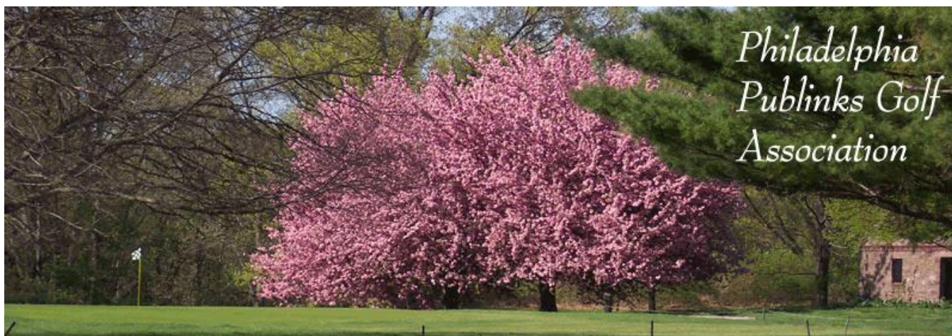
14th Hole at Cobbs Creek GC