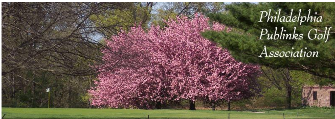
14th Hole at Cobbs Creek GC